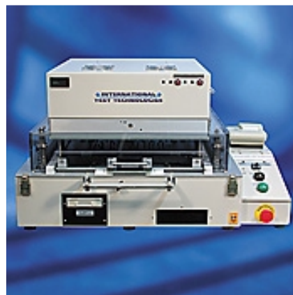
Fig. 2 – Fixture for Automated Connection